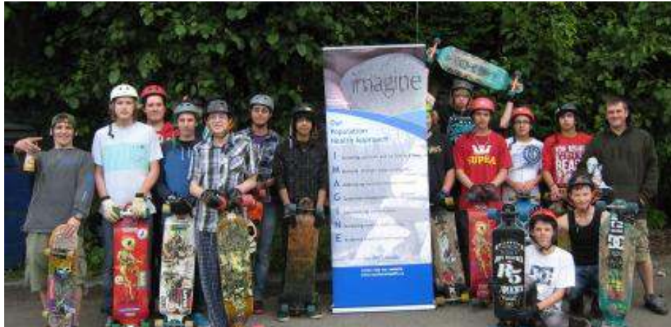
Prince Rupert RCMP - Long Board Safety (2014)