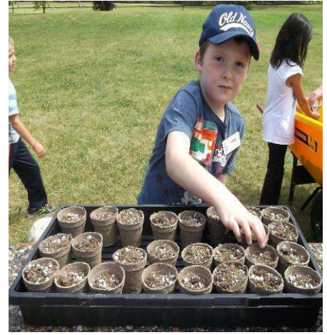
The Exploration Place – Explorers Urban Garden (2014)