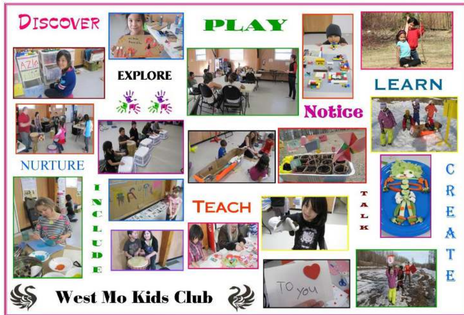
West Moberly First Nations - West Mo Kids club (2014 - Moberly Lake)