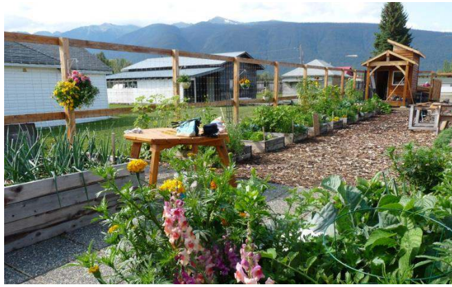
The Robson Valley Community Learning Project - The Open Gate Garden, Phase 2 Expansion (2014 - McBride)