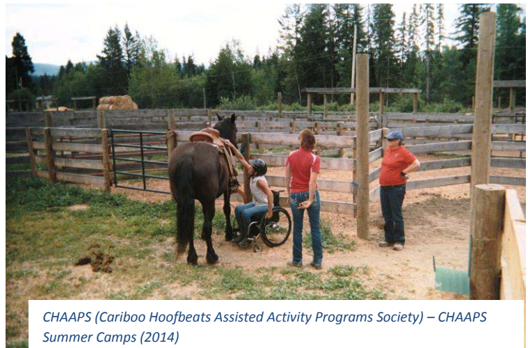
CHAAPS (Cariboo Hoofbeats Assisted Activity Programs Society) – CHAAPS Summer Camps (2014)