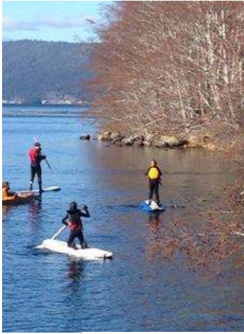
Agnes L. Mathers School – Outdoor Education (2014)