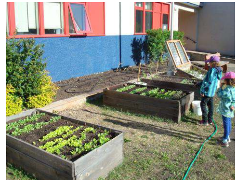
Groundbreakers Agricultural Association – Learning Gardens and Local Food Education Project (2014)