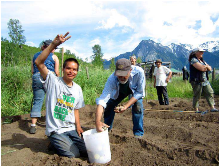
Storytellers' Foundation – Backyard Gardeners (2014)